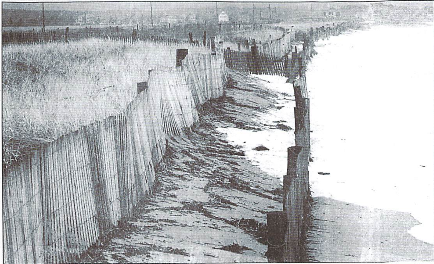
The astronomical high tides nearly overwhelmed Duxbury Beach, Monday.